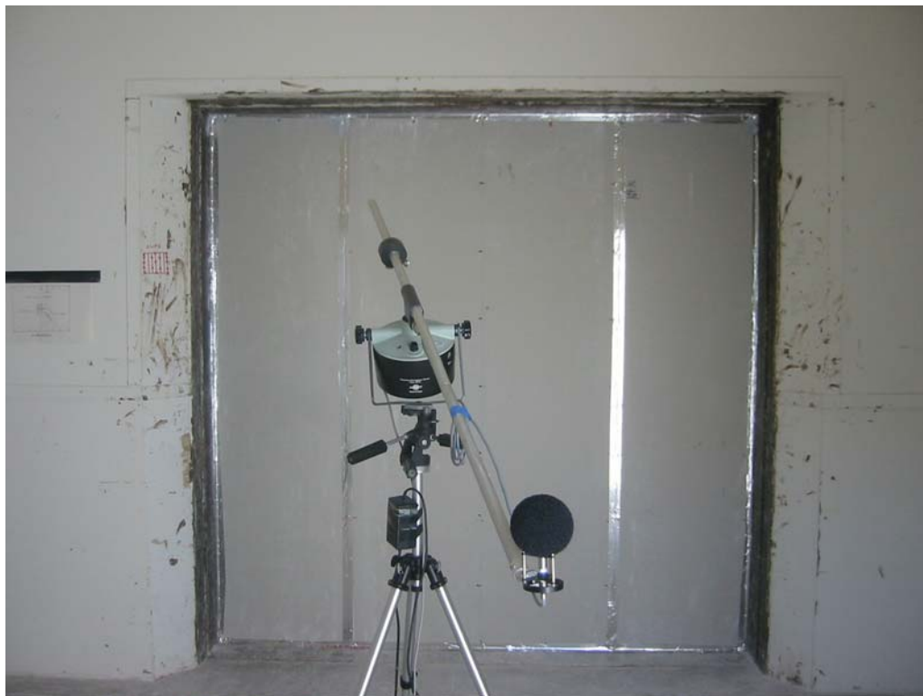
Figure 1: Photograph of source room side of partition