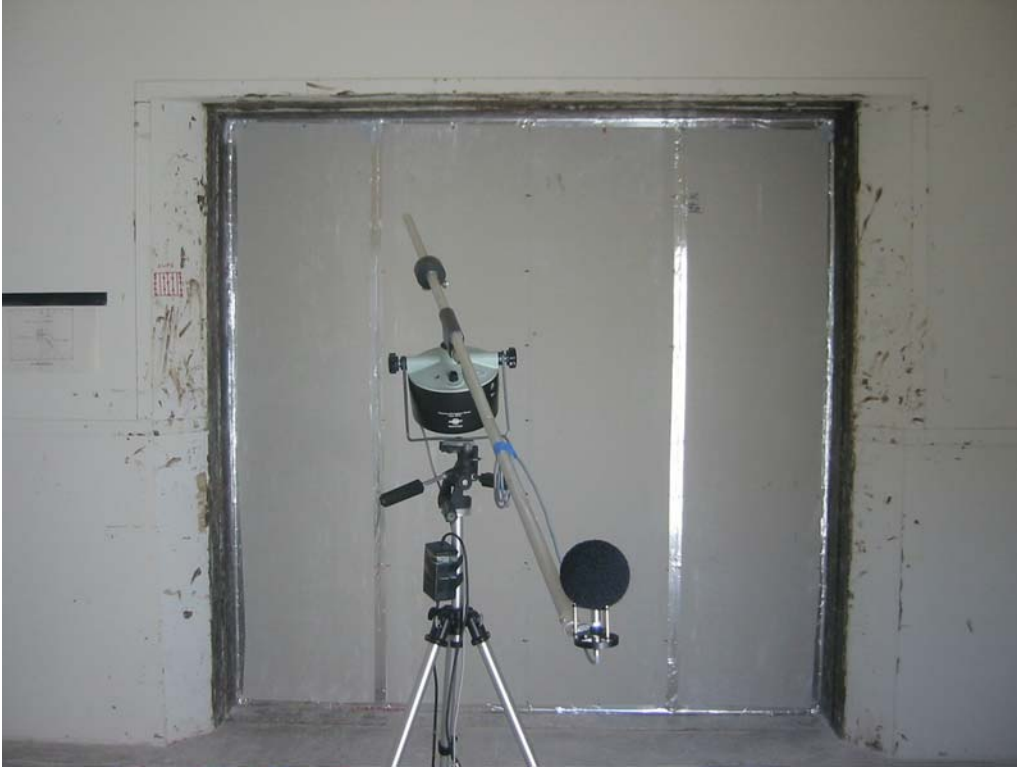
Figure 1: Photograph of typical staggered seams on source room side of partition

The perimeter of the specimen was sealed, on both on the source and receiver room sides, with Quiet Solution QuietSeal Pro and then covered with Nashua 322, 5 mil foil tape.