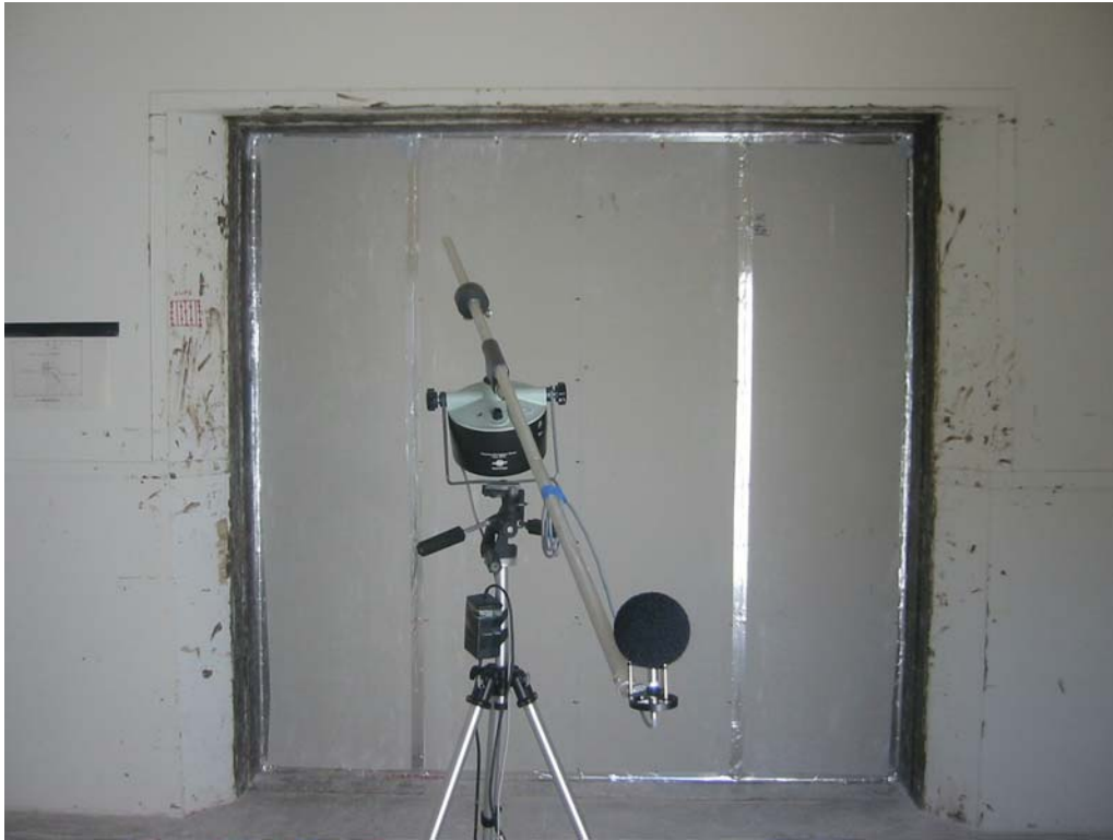
Figure 1: Photograph of typical staggered seam pattern on source room side of partition