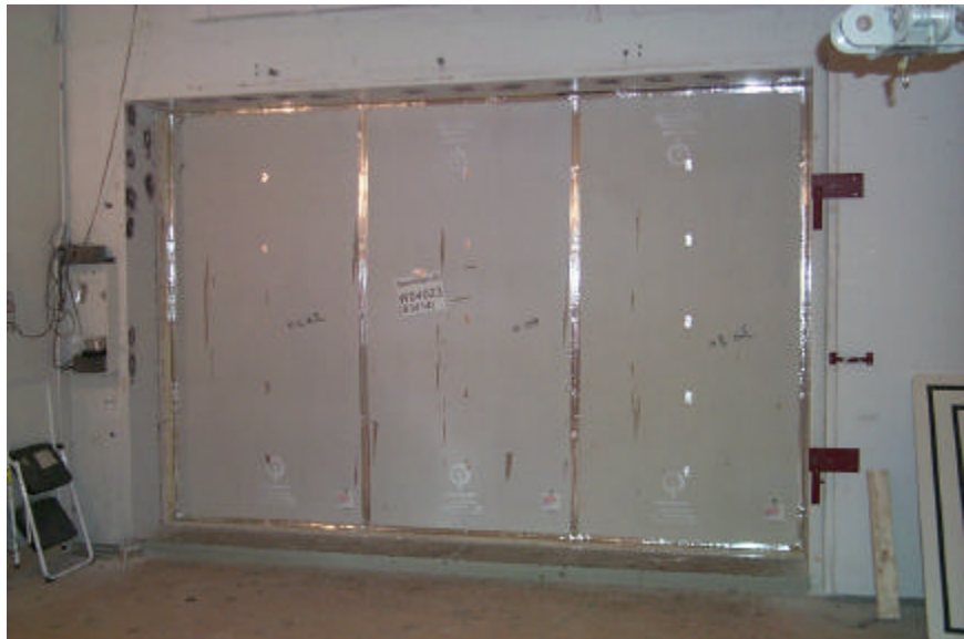
Figure 1: The Specimen B3414-6 installed in the IRC acoustical wall test frame.

single wood stud cavity. A single layer of 16mm QuietRock QR-530 Serenity with a single layer of 16mm gypsum board were installed vertically on one side of the wood studs. A single layer of 16mm of gypsum board was installed vertically on the other side of the wood studs. All were attached on the wood studs with Type S drywall screws, 41mm long and spaced at 406mm oc along the edges and in the field. The joints of the gypsum board were staggered by 610mm with the joints of the QuietRock QR-530 Serenity. A product identified by the client as QuietSeal was used to seal all the joints of the QuietRock QR-530 Serenity and of the gypsum boards, then covered with metal tape. The perimeter of the specimen was also caulked with QuietSeal and covered with metal tape.