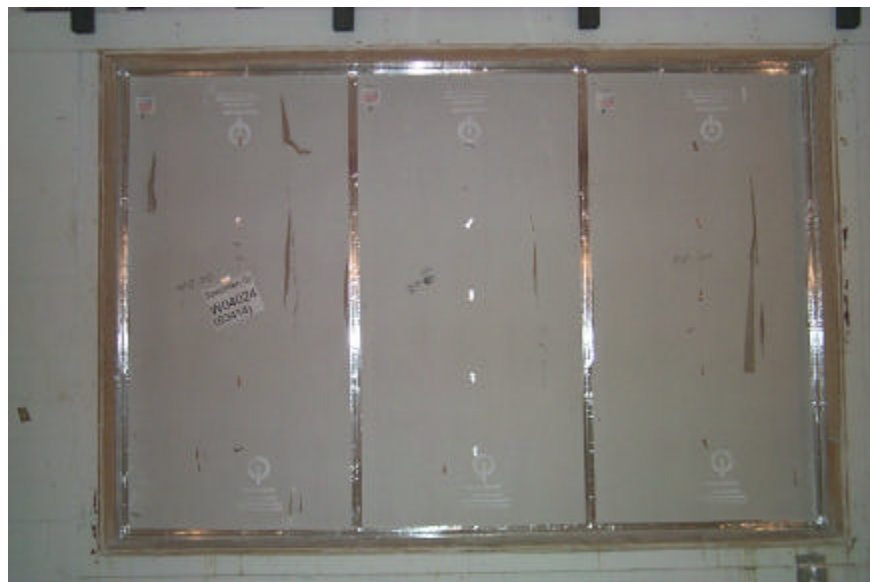
Figure 1: The Specimen B3414-7 installed in the IRC acoustical wall test frame.

single wood stud cavity. The base layer on both sides of the wall was 16 mm gypsum board installed vertically and attached to the wood studs using Type S drywall screws, 41mm long and spaced 406mm oc along the edges and in the field. The face layer on both sides of the wall was 16mm QuietRock QR-530 Serenity installed vertically and attached to the wood studs using Type S drywall screws, 41mm long and spaced at 406mm oc along the edges and in the field. The joints of the gypsum board base layer were staggered by 406mm with the joints of the QuietRock QR-530 Serenity face layer. A product identified by the client as QuietSeal was used to seal all the joints of the QuietRock QR-530 Serenity and the gypsum boards then covered with metal tape. The perimeter of the specimen was also caulked with QuietSeal and covered with metal tape.