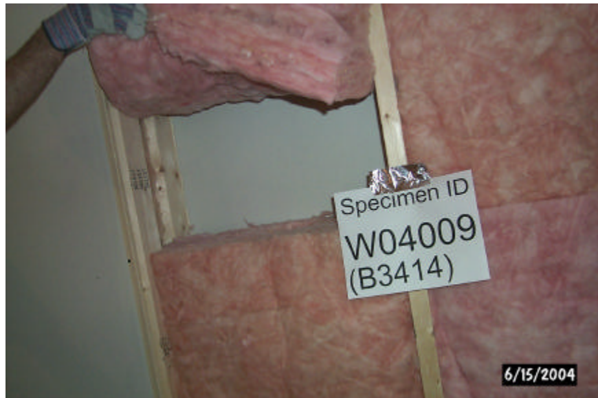
Figure 1: The Specimen B3414-1 showing the 241 mm of insulation in the double wood stud cavity.

A double row of wood studs were spaced at 610mm on center, separated by a 76 mm air space. The glass fibre batts with a thickness of 241 mm were installed in the double wood stud cavity. A single layer of 16mm QuietRock QR-530 Serenity drywall was attached vertically to the wood studs on both sides with Type S drywall screws, 41mm long and spaced at 406mm oc along the edges and in the field. A product identified by the client as QuietSeal was used to seal all the joints of the QuietRock QR-530 Serenity then covered with metal tape. The perimeter of the specimen was also caulked with QuietSeal and covered with metal tape.