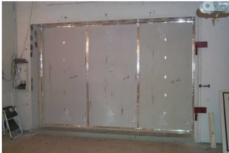
Figure 1: The Specimen B3414-1 installed in the IRC acoustical wall test frame.

The wood studs were spaced at 610mm on center. The glass fibre batts with a thickness of 241 mm were installed in the double wood stud cavity. A double layer of 16mm QuietRock QR-530 Serenity was attached vertically to the wood studs with Type S drywall screws, 41mm long and spaced at 610mm oc along the edges and in the field for the base layer and 406mm oc for the face layer. The joints of the face layer of the QuietRock QR-530 Serenity were staggered by 610mm from the joints of the face layer of the QuietRock QR-530 Serenity. A product identified by the client as QuietSeal is used to seal all the joints of the QuietRock QR-530 Serenity then covered with metal tape. The perimeter of the specimen was also caulked with QuietSeal and covered with metal tape.